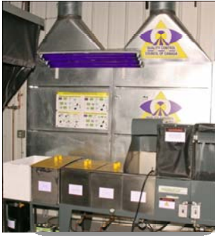
Figure 3 - Liquid Penetrate Station.

The QCCC training Center is an accredited training centre and written test centre for the Canadian Government Standards Board (CGSB). They offer courses in; Advanced Ultrasonics (including Phased Array), Magnetic Particle and Liquid Penetrate Inspection as well as Heat Treatment and Stress Relieving